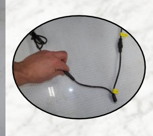
4-A & B: Plug the wires to the transformer (contained in plastic bag).